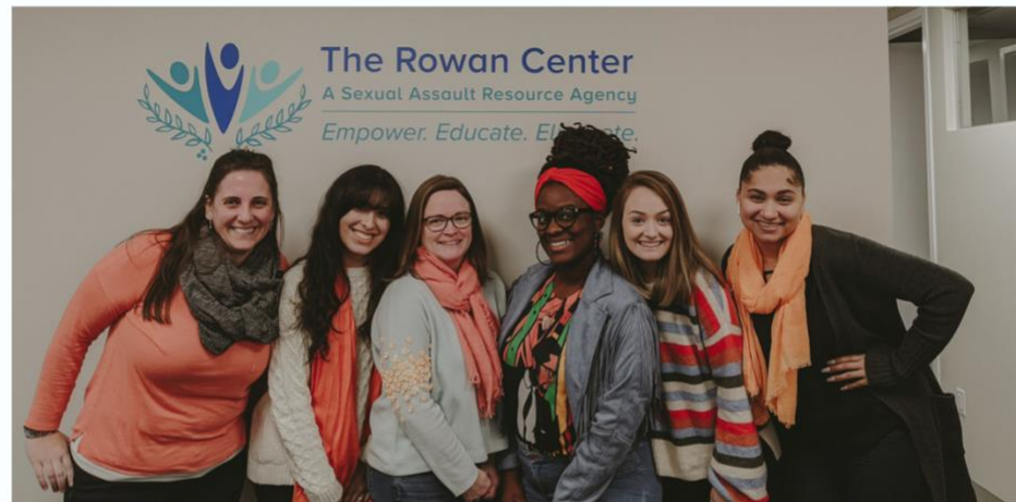
Our staff in orange to support Teen Dating Violence Awareness Month

Director of Education, Outreach, & Operations