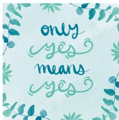
Sample of Rowan Center Instagram posts-original content